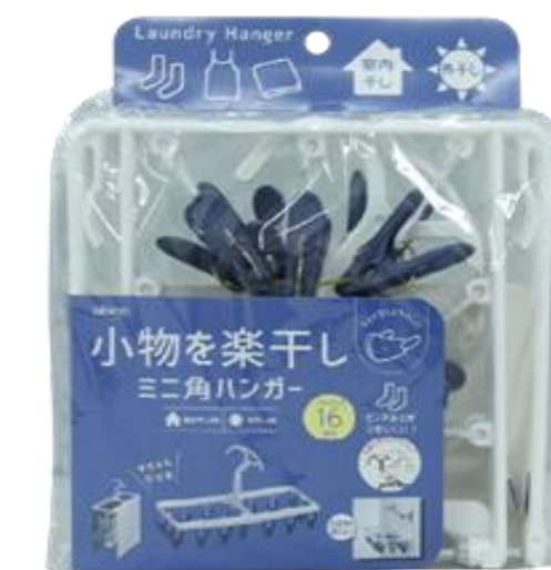
LK402 Laundry Hanger Mini 16 Pinches

The length of the elastic belt can be adjusted to keep the laundry horizontal. You can also pull out the spacers to prevent them from hitting the wall. (LK162, LK167)