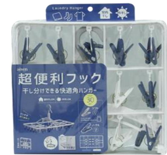
LK422 Laundry Hanger Free Angle Hook 30 Pinches