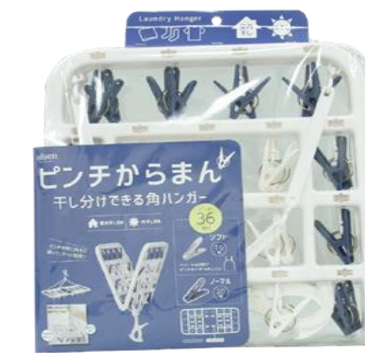
LK162 Laundry Hanger Easy Storing