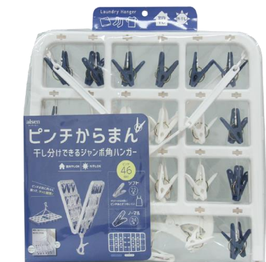
LK167 Laundry Hanger Large 46 Pinches