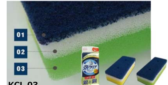
KCL 03 Anti-Bacterial Kitchen Sponge Hard