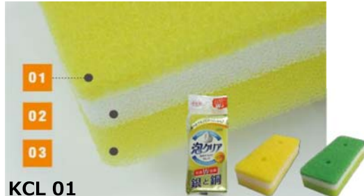
KCL 01 Anti-Bacterial Kitchen Sponge Soft